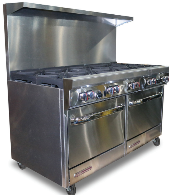
(S60DD shown with optional casters)