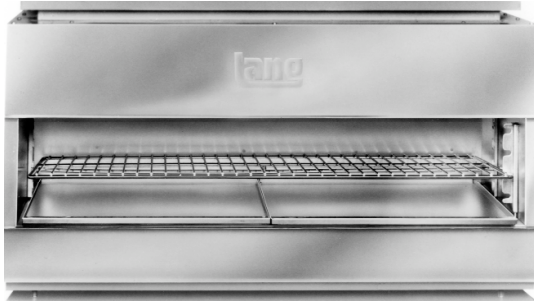
Model 248CMW shown