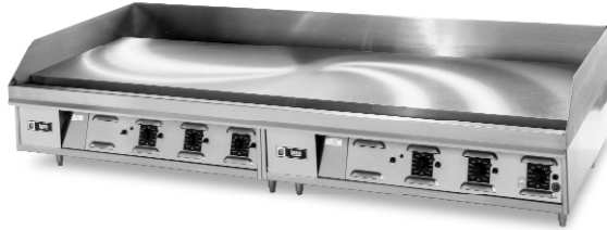
Model 236T shown