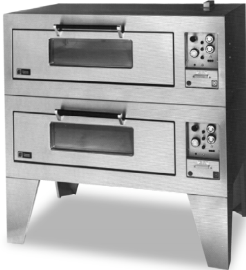
Model D054B2 shown