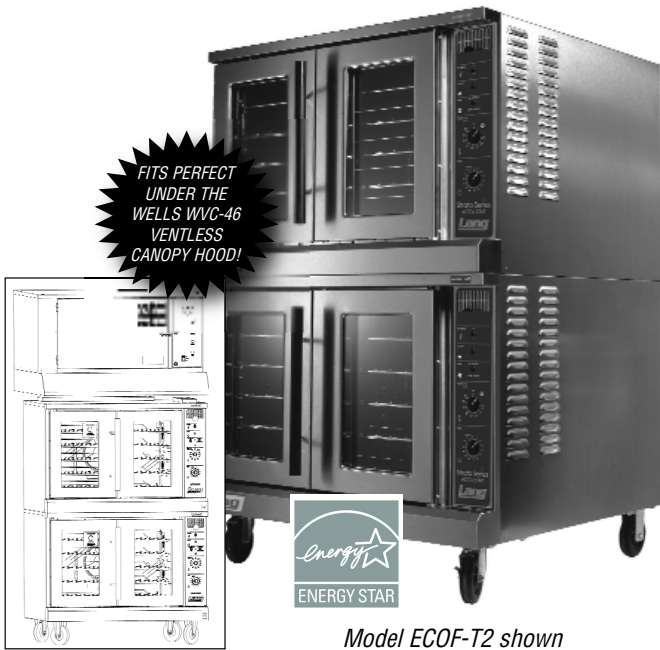
Model ECOF-T2 shown