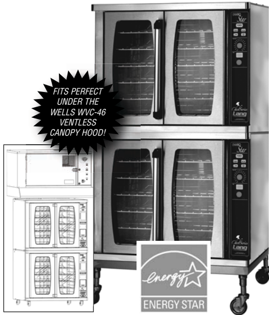
Model ECSF-ES2 shown