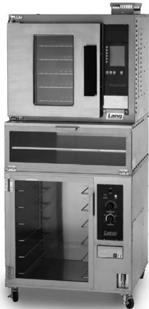
Model MB-PT shown