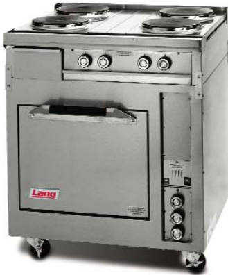
Model R30S shown