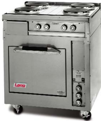
Model R30S shown