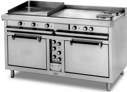
Model R60S-ATC shown