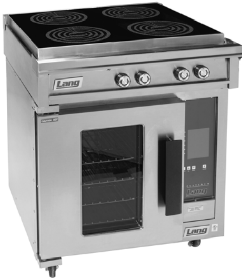
Model RI30C-PTA Shown