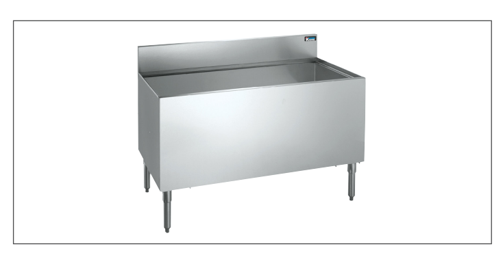
KR18-CB48 CHILLMASTER BEER BIN SHOWN