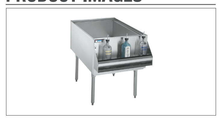
KRPT-2436 PASS THRU ICE BIN SHOWN