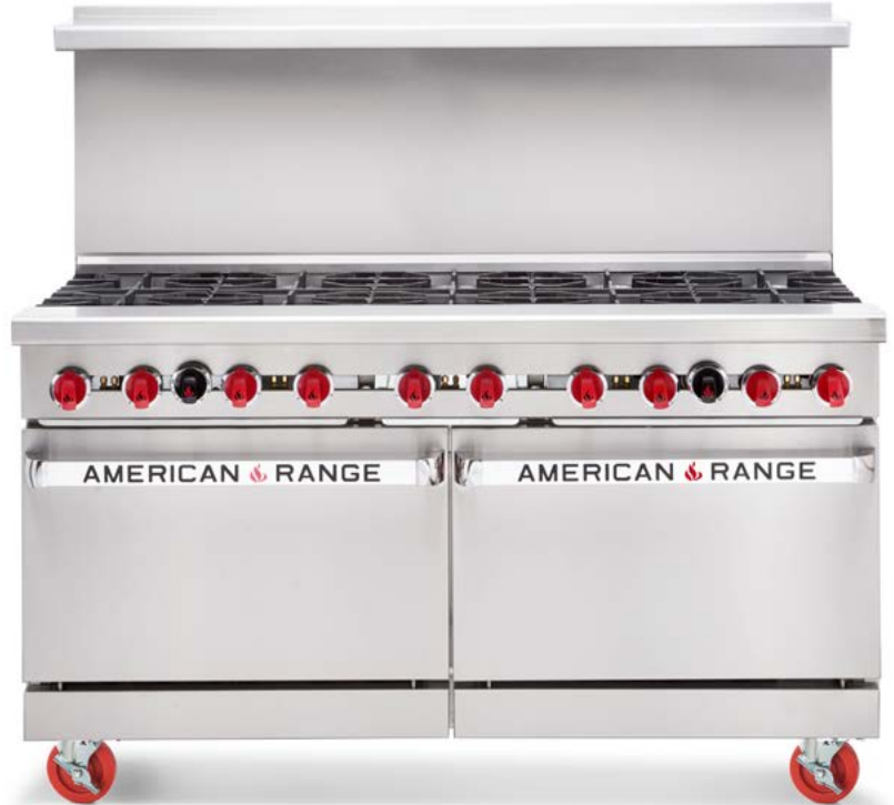
Model AR12G-8B Shown with optional stand & casters.

The Heavy Duty Restaurant Range Series by American Range was designed for continuous rugged use and performance. All the latest technology is incorporated to give you the best value for your money.