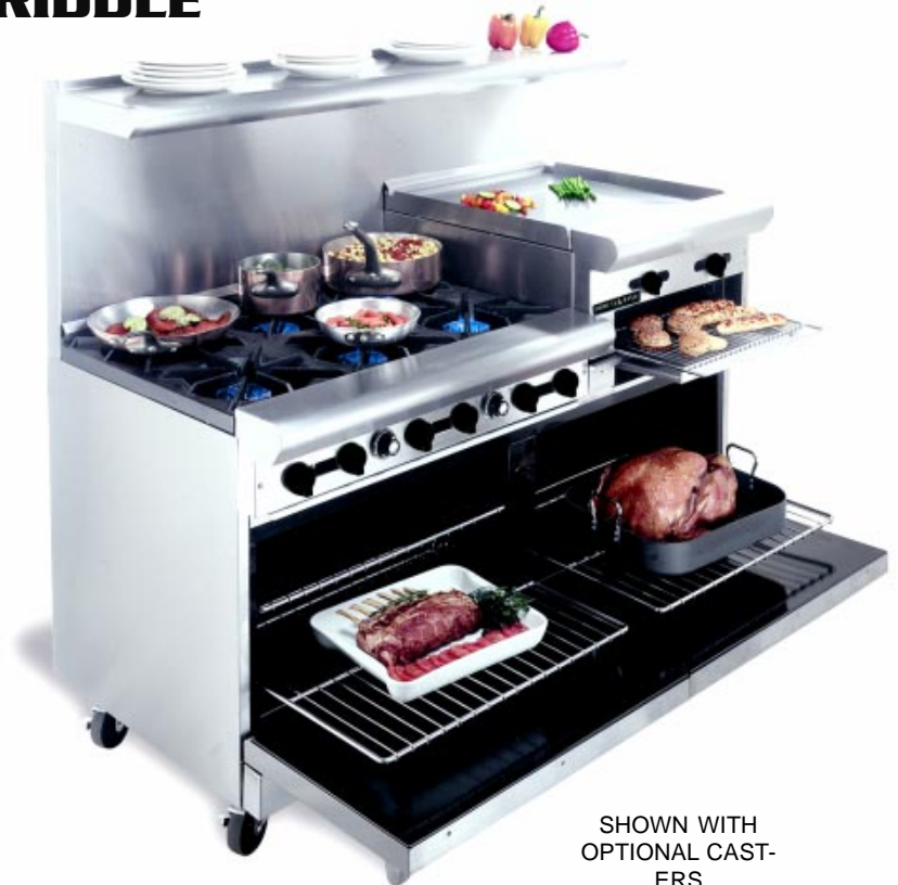
SHOWN WITH OPTIONAL CAST- ERS

The Heavy Duty Restaurant Range Series by American Range was designed for continuous rugged use and performance. All the latest technology is incorporated to give you the best value for your money. You wanted power! We give it to you with 32,000 BTU per open top burner, and 20,000 BTU per griddle burner. Our Raised Griddle range combinations gives your chef the convenience of a broiler in the same space as a griddle. The highly efficient burners placed every 12" and fitted with a uniquely designed reflector evenly heat the highly polished griddle plate at the same time producing the searing heat required for broiling dishes such as steak, lobster, fish, and many more. Allows quick and easy preparation of garlic toast and melted cheese plates.