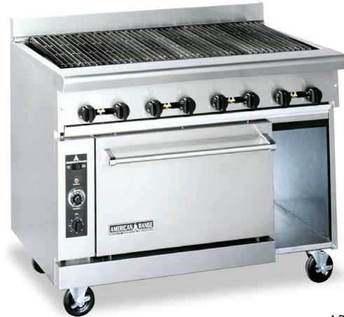
AR-4RB-CS Shown with optional Casters & Convection Oven with Storage Base