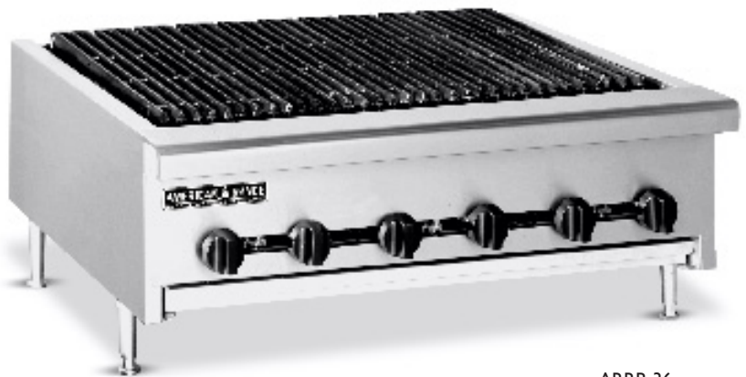
ARRB-36 Shown with optional 4" counter legs