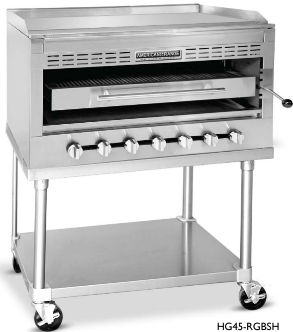
HG45-RGBSH Shown with optional casters and stand.