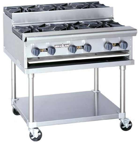
SUHP-36-6 Shown with optional stand and casters