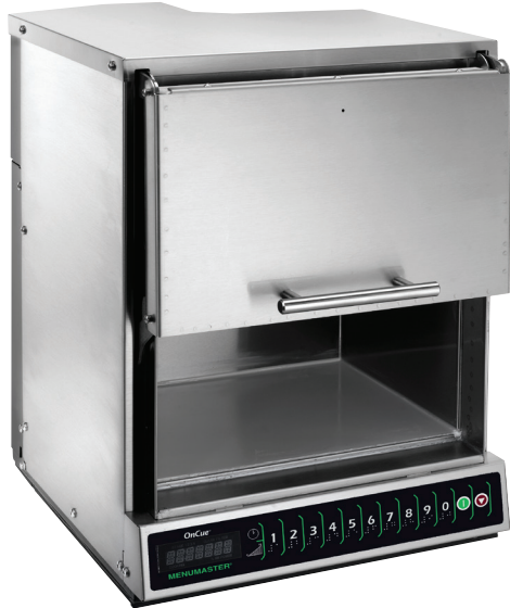
MOC24 shown with door open