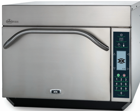
Model MXP22 shown

15 times faster than conventional ovens.