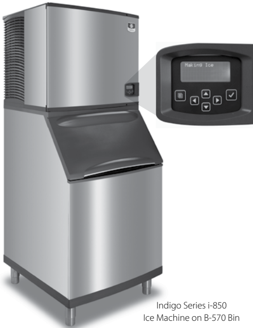
Indigo Series i-850 Ice Machine on B-570 Bin

Designed for operators who know that ice is critical to their business, the Indigo™ Series ice machine's preventative diagnostics continually monitor itself for reliable ice production. Improvements in cleanability and programmability make your ice machine easy to own and less expensive to operate.