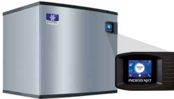
IDF2100C Ice Cube Machine - 115V