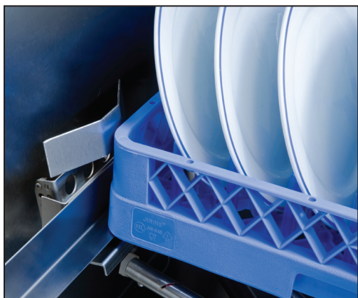
RackAware™ Automatic Rack Sensing System* only runs a cycle when a rack is present