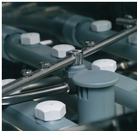
Superior cleaning action with 7 bayonet style wash arms with 42 fixed wash jets.