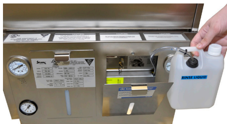
Chemical levels are always viewable and chemical replacement easily accessible with front mounted containers.