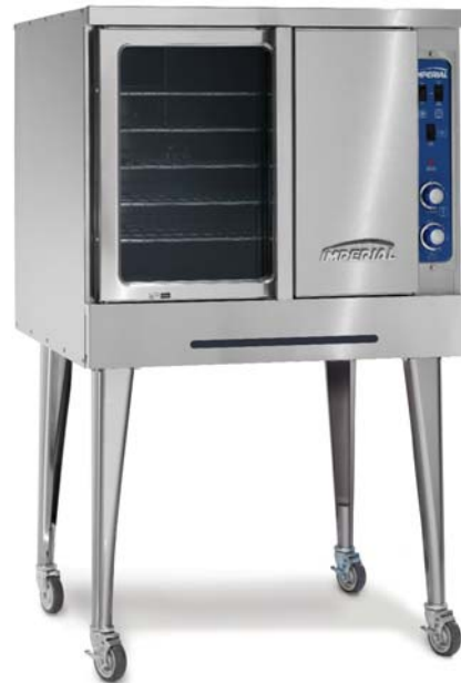
ICV-1 shown with optional casters

Four bearings per door extend the life of the door mechanism.