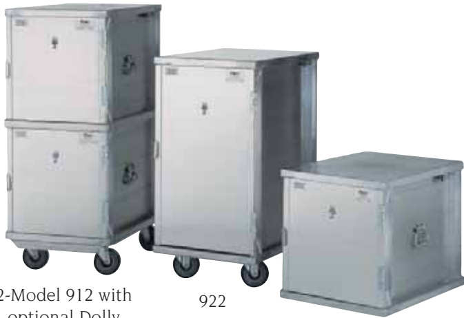
2-Model 912 with optional Dolly (2-2128) and chest handle