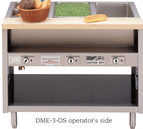
DME-3-OS operator's side

Pipermatic Stationary Hot Food Tables are designed to hold and maintain the temperature of hot food in various size pans for use in meal assembly on tray lines and cafeterias. Available with an optional extended, continuous perimeter bumper, this unit is designed to survive the rigors of typically heavy institutional use. The rugged, all stainless design insures years of easy cleanability and low maintenance use.