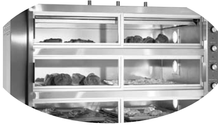
DO-PB-G Individual Sliding Doors

This 6-pan oven, 16-pan proofer meets all your baking needs! We've combined our deck oven technology and hassle-free proofer, giving you a single, compact unit that consistently delivers quality, hearth-baked product with a minimum of effort.