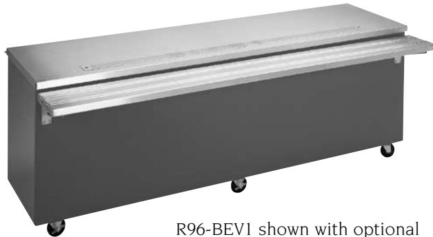
R96-BEV1 shown with optional solid ribbed tray slide

Designed to keep your serving area clean and functional, these Piper Beverage Counters are sure to complete your line-up. The standard full length drains will keep hazardous spills from your floors. Units are a full 30" deep to accommodate nearly all coffee makers.