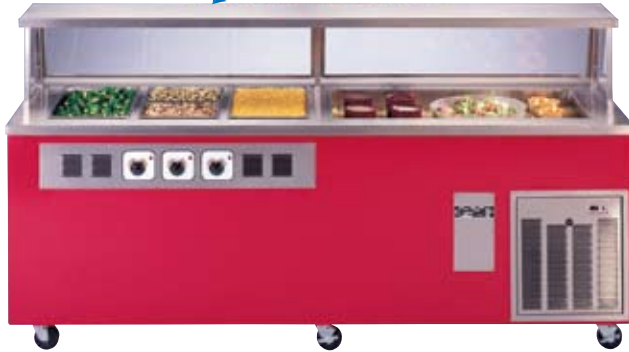
R3H3CM operator's side shown with optional CPG protector guard

The Reflections Hot/Cold Combo units are ideal for use in cafeteria/buffet lines, school line-ups, hospital cafeterias and lounges. With "works-in-a-drawer" access, these units are easy to maintain. The Reflections units are compatible and will interlock with other Piper Reflections units.