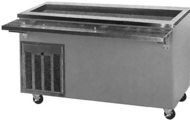
R5-CM shown with optional 3-ribbed tray slide

The Piper Cold Food Units are available mechanically cooled (R-CM) or ice only (R-CI). These units are designed to serve a variety of refrigerated food products and are ideal as a salad bar merchandiser. The versatile modular design allows you either a cafeteria or a buffet unit to fit your line-up. Reflections units are compatible and will interlock with other Reflections units.