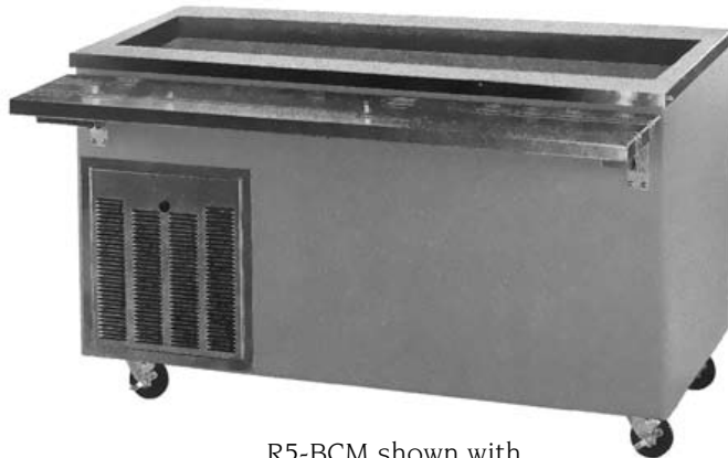
R5-BCM shown with optional 3-ribbed tray slide

The Piper Bloomington Cold Food Unit features an extra deep cold pan of 9-7/16" deep and is listed NSF Standard 7. The Bloomington Cold Units are designed to serve a variety of refrigerated food products, these units are ideal as a salad bar merchandiser. Reflections units are compatible and will interlock with other Reflections units.