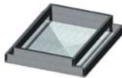
PIPER'S SUPERIOR FOUNDATION Fully welded coated steel frame with 18 gauge base plate