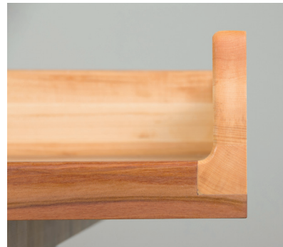
COVED RISER (FRONT VIEW)