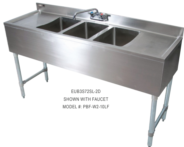
EUB3S72SL-2D SHOWN WITH FAUCET MODEL #: PBF-W2-10LF