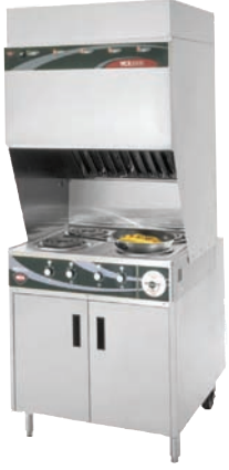
Model WV4HS SHOWN