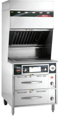
Model WVG136RW SHOWN