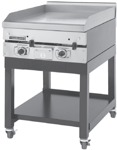
Model G24-24GTHX (shown mounted on CS24-24 stand/w casters)