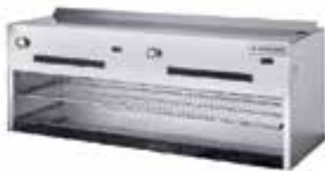
Model shown IRCMA-48