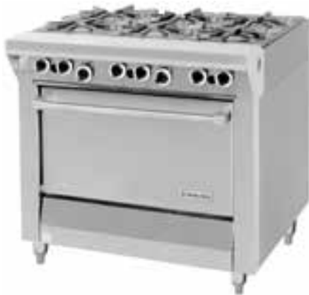
Model M43R Range With Six Open Star Burners