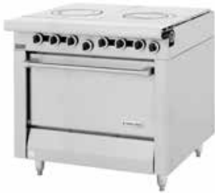
Model M45R Two Front-Fired Hot Top Range