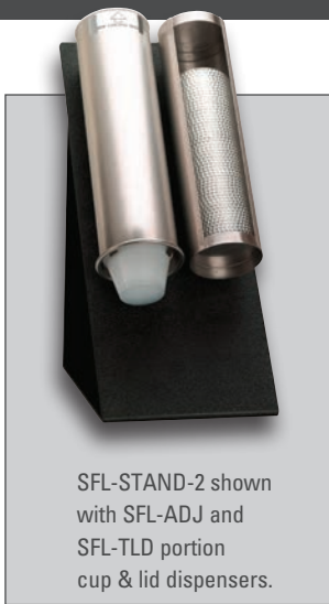
SFL-STAND-2 shown with SFL-ADJ and SFL-TLD portion cup & lid dispensers.