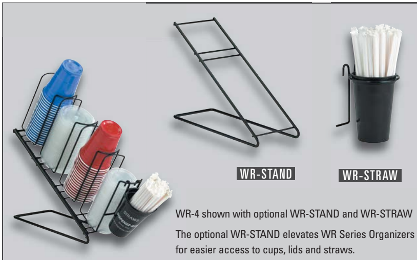
WR-4 shown with optional WR-STAND and WR-STRAW The optional WR-STAND elevates WR Series Organizers for easier access to cups, lids and straws.