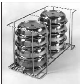
"C" carrier for covered plates

REMOVABLE WIRE SHELVES... Welded, duplex nickel-plated with reinforced shelf clips. Sturdy for heavy plate loads and removable for cleaning.