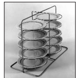
"P" carrier for open plates

OPTIONAL PLATE CARRIERS... "P" or "C" carriers are available. "P" type holds 8-3/4" to 10-1/2" diameter open plates while "C" type holds up to 10-1/2" diameter covered plates. Specify type, if any, when ordering. Carriers will hold plates 4-high (8C or 8P) in carts with 13" shelf spacing and 5-high (10C or 10P) in carts with 16" shelf spacing. See table on front page for types and quantities that will fit in each cart.