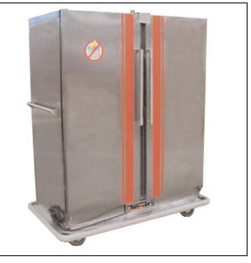
NON-MARKING BUMPER SET IN HEAVY-DUTY 3/16" THICK EXTRUDED ALUMINUM FRAME... Protects doorways, walls and cart from damage. Reinforced with 12 gauge angle bracket for added strength.

Stainless steel tubular handle for comfortable grip. Mounted with backup plates for added durability. Roller latch design has been a proven performer for over 10 years.