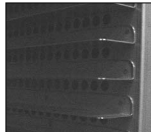
HWC fixed angle slides

HWC: Fixed stainless steel angle slides on 1-1/2" centers hold 18"x26" sheet pans.