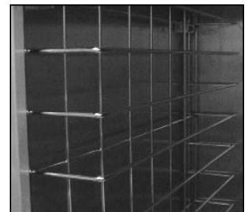
HWF fixed universal wire slides