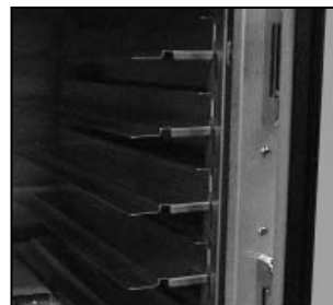
HWU adjustable universal slides