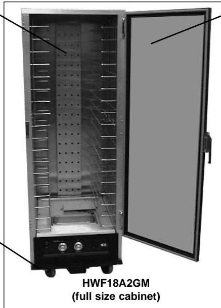
HWF18A2GM (full size cabinet)

DRIP TROUGH... Located at base of cabinet to catch condensation. Drain hole in center. Plastic drip pan below trough (provided) to catch condensation.