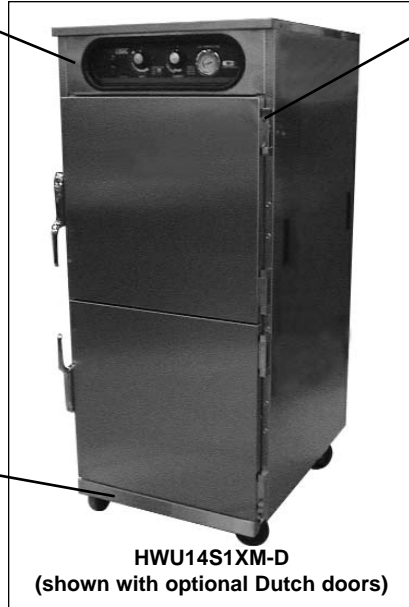
HWU14S1XM-D (shown with optional Dutch doors)

STAINLESS STEEL DRIP TROUGH... Located at base of door to catch condensation. Easy to remove sliding keyhole design for emptying and cleaning.