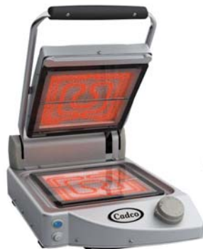
CPG-10FC(120 & 220)