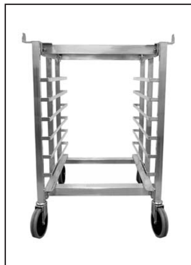
OST-34A Half Size Stand with Wheels