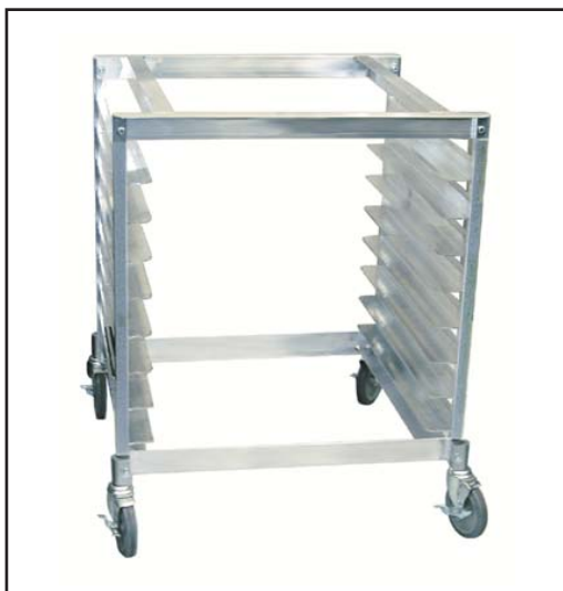
OST-195 Full Size Stand with Wheels